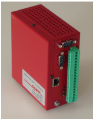
SCD-II (Smart Communication Device)

The DNC4000 v5 recognizes any change in a NC program. The integrated WinMerge editor compares the two versions and highlights the changes.